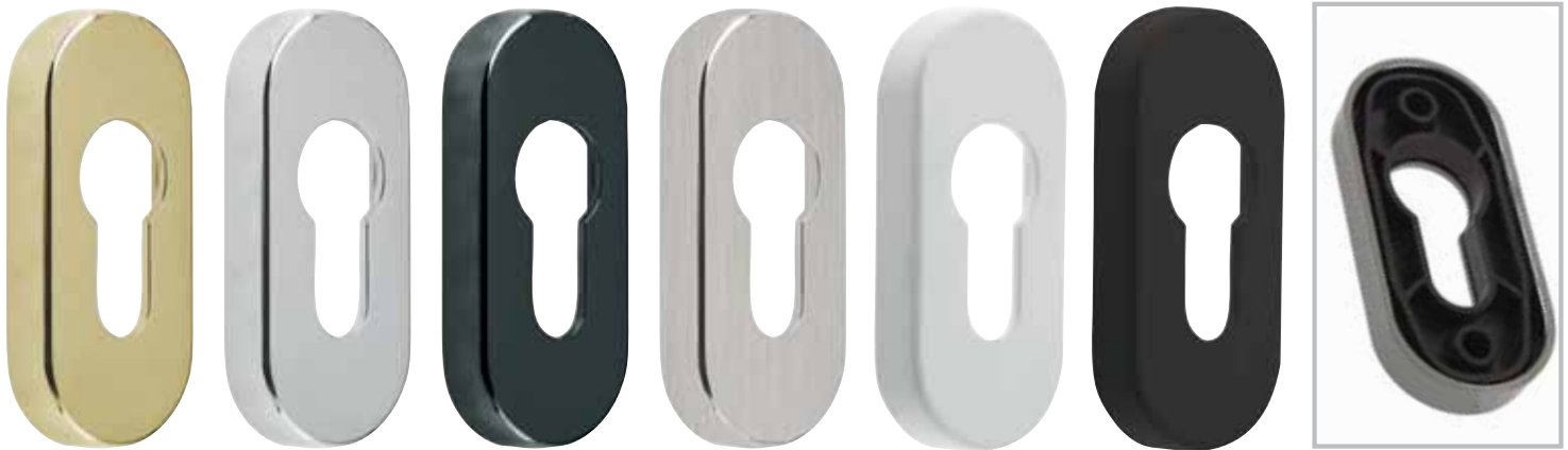
Above: ProLinea Escutcheons shown in polished gold PVD, polished chrome with SupaChrome500 coating, smokey chrome, brushed satin chrome, white and black.