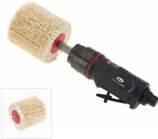
Sisal mop replacement

The Xpert Air Sisal machine is perfect for polishing PVCu window frames.