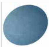
Front of pad

Spare backing pads for the Orbital Air Sander