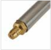
Stainless steel nozzle