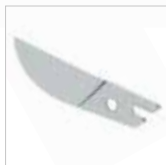
SK5 spare blade