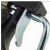
Clutch function to prevent drips