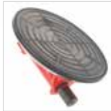
Rubber vacuum pad