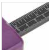
mm & cm marked

The Xpert Glass Thickness Gauge allows you to accurately measure the thickness of sealed units without removing them.