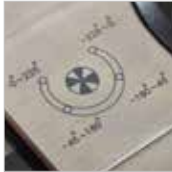
4 locking holes