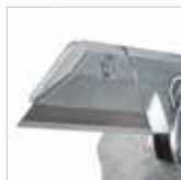
Quick change blade