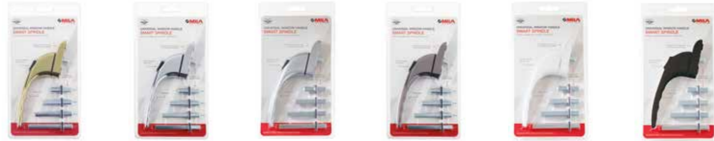
Polished Gold RP581901 Polished Chrome RP581902 Brushed Satin Chrome RP581904 Smokey Chrome RP581903 White RP581900 Black RP581905